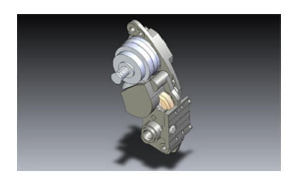
Hyper Sonic Motor

For comfortable and smooth use with the high zoom ratio, 16.6 times, it incorporates a bigger HSM (Hyper Sonic Motor) which is newly developed for this lens. It is powerful enough to ensure high speed and quiet AF.