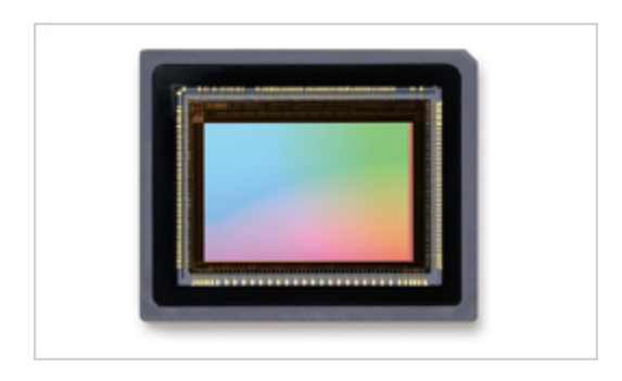
46-megapixel Foveon direct image sensor

We used to measure lens performance with an MTF measuring system using conventional sensors. However, we've now developed our own proprietary MTF (modulation transfer function) measuring system (A1) using 46-megapixel Foveon direct image sensors. Even previously undetectable high-frequency details are now