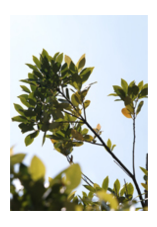
With Super Multi-Layer Coating