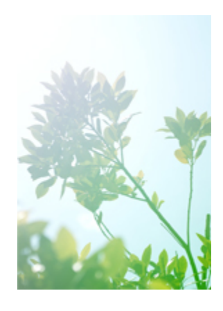
No Super Multi-Layer Coating

Flare and ghosting were thoroughly measured and monitored from the lens development stage to establish an optical design which is resistant to strong incidental light such as backlight. The Super Multi-Layer Coating reduces flare and ghosting and provides sharp and high contrast images even in backlit conditions.